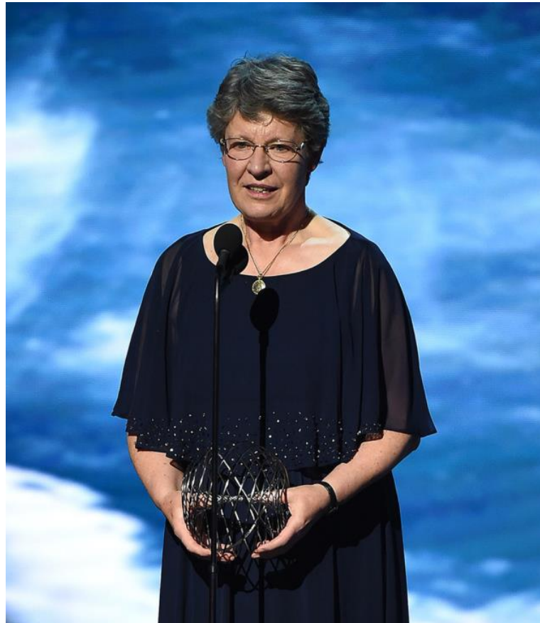
Dame Jocelyn Bell Burnell accepts Special Breakthrough Prize.

In 2018 Bell Burnell she was awarded the Special Breakthrough Prize in Fundamental Physics. The Prize was worth $3 million (£2.3 million). A not inconsiderate sum. She donated the entire sum to help fund women, minority groups and refugees to become researchers in physics through the Bell Burnell Graduate Scholarship Fund which is administered by the Institute of Physics.