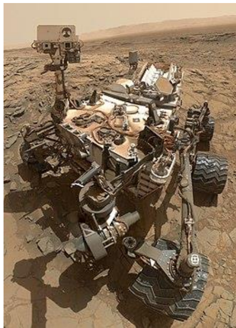
Curiosity Self-Portrait at 'Big Sky' Drilling Site.

The Curiosity Rover has 6 wheels. It has a laser to study absorptions. There is a robotic arm, as well as GC/MS, X-ray spectrometer and devices to study X-ray diffraction. Also, there are other environmental instruments. The daily power budget is about 100 Watts! It only operates after 11 am, after the planet warms up. So there is a daily pattern of data recording.