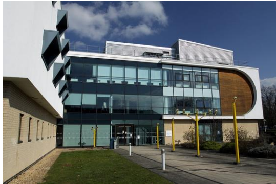
Robert Hooke Building, Open University.

Last year's Fusion weekend was held at the OU Campus at Walton Hall the weekend of 7 th /8 th September – a change of dates to best coincide with the change of the OUSA financial year.